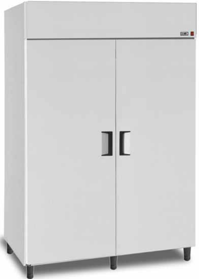
I-Ola P AG*